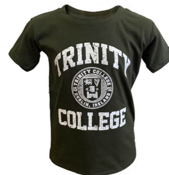
TRIN7011 BOTTLE/WHITE TRINITY COLLEGE CREST KID'S T-SHIRT (1/2 - 11/12)