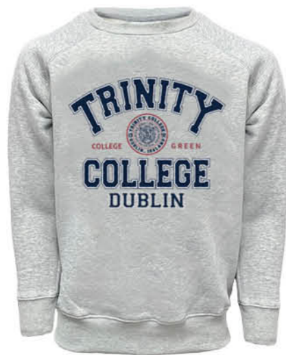
TRIN5107 GREY MARL/ NAVY TRINITY COLLEGE SWEATSHIRT (XS,S,M,L,XL,XXL)