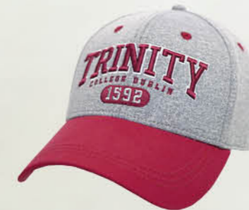
TRIN6007 GREY MARL/BURGUNDY TRINITY 1592 B/BALL CAP (ONE SIZE)