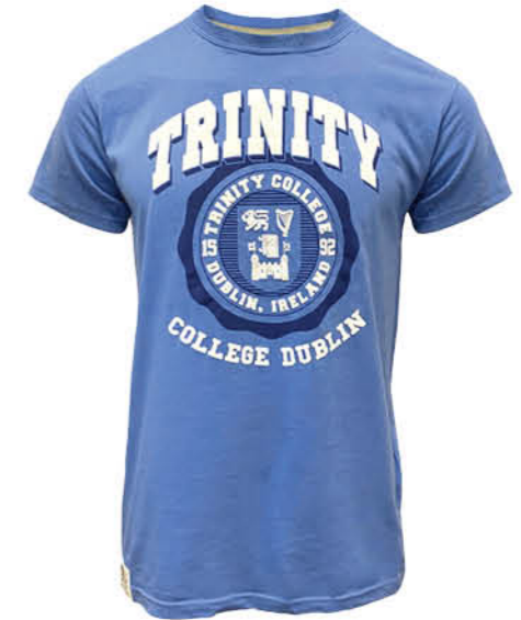
TRIN1034 CORNFLOUR BLUE TRINITY CREST T-SHIRT (XS,S,M,L,XL,XXL)