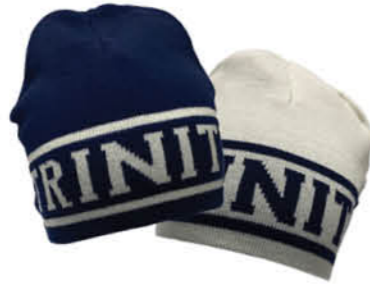
TRIN6020 NAVY/CREAM TRINITY REVERSIBLE KNIT HAT (ONE SIZE)