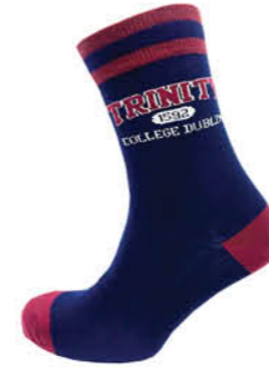
TRIN9005 BURGUNDY/NAVY STRIPE TRINITY SOCKS (SIZE: 6-11)