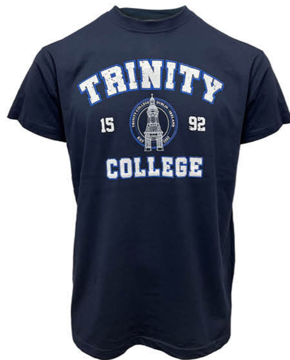
TRIN1030 NAVY / BLUE TRINITY CAMPANILE T-SHIRT (XS,S,M,L,XL,XXL)