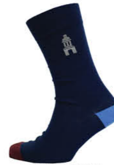
TRIN9003 NAVY TRINITY CAMPANILE SOCK (SIZE: 6-11)