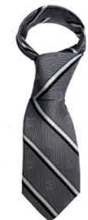
TRIN9030 GREY/BLACK STRIPE TRINITY COLLEGE DUBLIN TIE