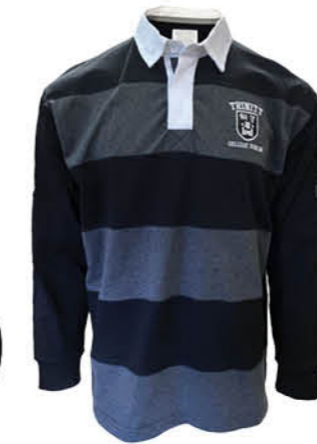
TRIN3001 BLACK/GREY TRINITY BCI PREMIUM LONG-SLEEVE RUGBY SHIRT (S,M,L,XL,XXL)