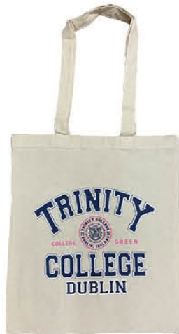
TRIN9027 NATURAL NAVY/PINK TRINITY COLLEGE DUBLIN TOTE BAG