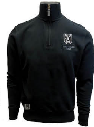
TRIN5082 BLACK/GREY TRINITY BCI PREMIUM 1/4 ZIP (XS,S,M,L,XL,XXL)