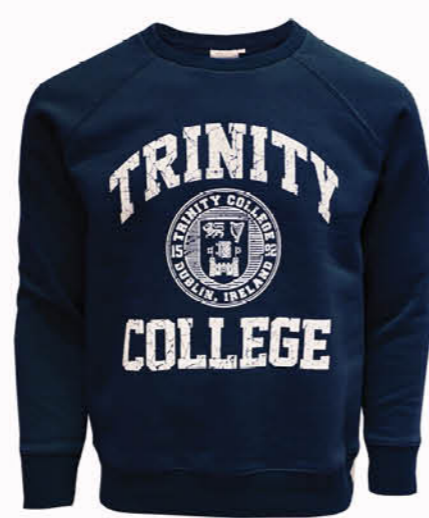
TRIN5137 NAVY TRINITY SWEATSHIRT (XS,S,M,L,XL,XXL)