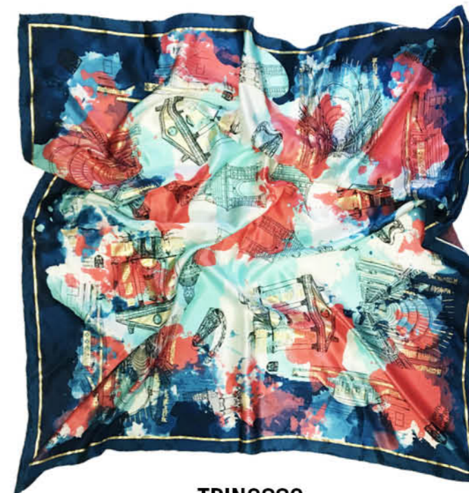
TRIN9002 NAVY/CORAL TRINITY SILK SCARF