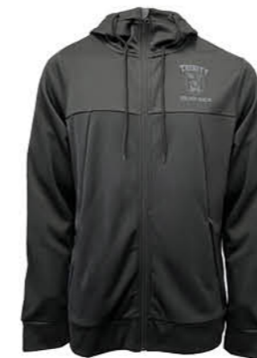
TRIN5084 BLACK/GREY TRINITY PERFORMANCE FULL ZIP HOODIE (XS,S,M,L,XL)