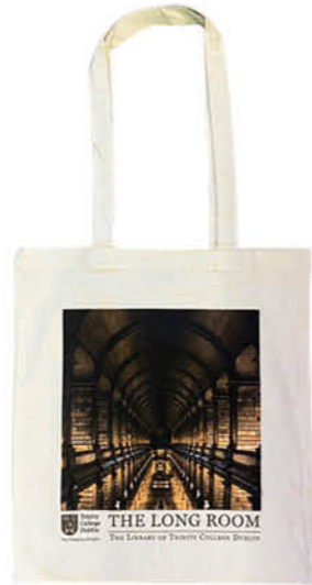
TRIN9017 TRINITY LONG ROOM NATURAL TOTE BAG