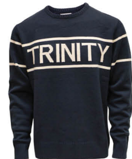
TRIN5006 NAVY/CREAM TRINITY KNIT JUMPER (XS,S,M,L,XL,XXL)