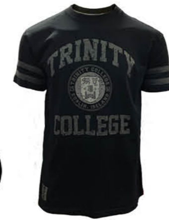
TRIN1031 BLACK/GREY TRINITY BCI PREMIUM T-SHIRT (XS,S,M,L,XL,XXL)