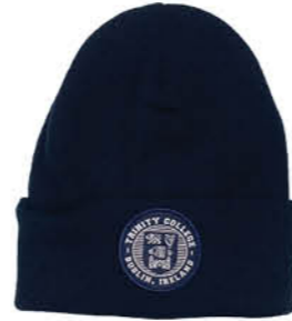
TRIN6024 NAVY TRINITY COLLEGE CREST KNIT HAT (ONE SIZE)