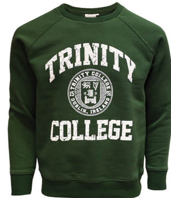
TRIN5005 BOTTLE / WHITE TRINITY COLLEGE CREST SWEATSHIRT (XS,S,M,L,XL,XXL)