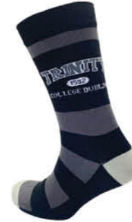
TRIN9033 BLACK/GREY TRINITY COLLEGE 1592 SOCKS (SIZES 6-11)