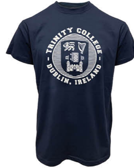
TRIN1027 NAVY / WHITE TRINITY COLLEGE ROUND CREST T-SHIRT (XS,S,M,L,XL,XXL)