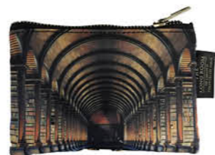
TRIN9009 TRINITY LONG ROOM PHOTO PURSE