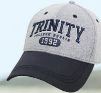
TRIN6006 GREY MARL/NAVY TRINITY 1592 B/BALL CAP (ONE SIZE)