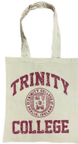
TRIN9024 BURGUNDY/NATURAL TRINITY COLLEGE CREST TOTE BAG