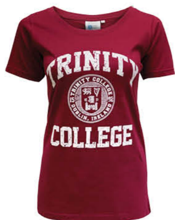
TRIN4000 BURGUNDY / WHITE TRINITY COLLEGE CREST LADIES T-SHIRT (XS,S,M,L,XL)