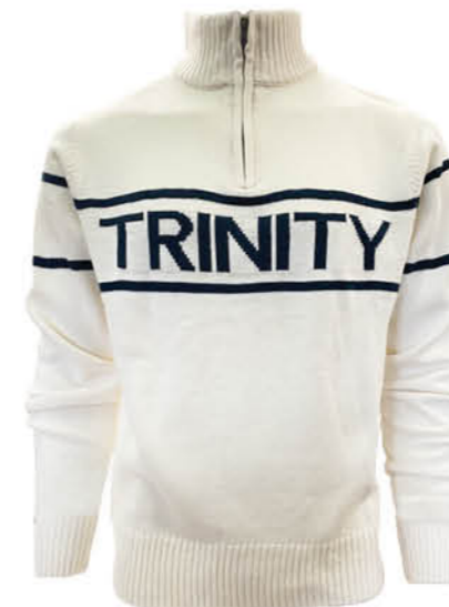
TRIN5089 CREAM/NAVY TRINITY KNIT 1/4 ZIP JUMPER (XS,S,M,L,XL,XXL)