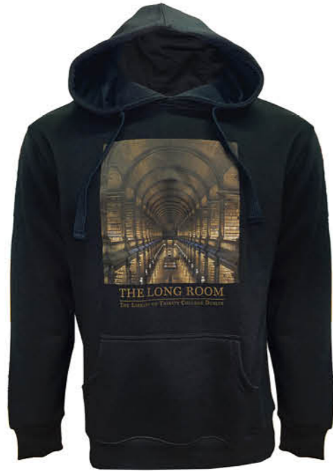
TRIN5069 BLACK TRINITY THE LONG ROOM SUSTAINABLE HOODIE (XS, S, M, L, XL, XXL)