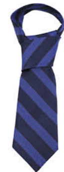
TRIN9007 NAVY/BUE TRINITY STRIPE SILK TIE