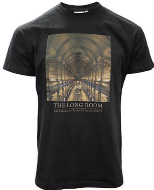
TRIN1022 BLACK TRINITY THE LONG ROOM T-SHIRT (XS, S, M, L, XL, XXL)