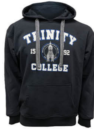
TRIN5066 NAVY / BLUE TRINITY CAMPANILE HOODIE (XS,S,M,L,XL,XXL)