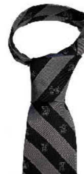
TRIN9031 BLACK/GREY STRIPE TRINITY COLLEGE DUBLIN TIE