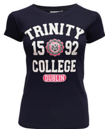
TRIN4001 NAVY / PINK TRINITY 1592 LADIES T-SHIRT (XS,S,M,L,XL)