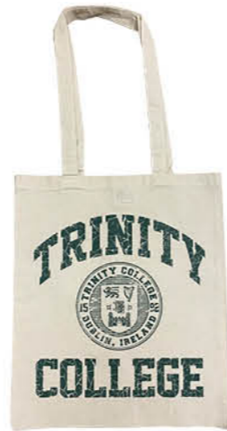
TRIN9026 BOTTLE/NATURAL TRINITY COLLEGE CREST TOTE BAG