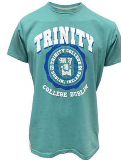
TRIN1033 OCEAN GREEN TRINITY CREST T-SHIRT (XS,S,M,L,XL,XXL)