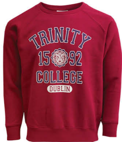
TRIN5003 BURGUNDY / NAVY TRINITY 1592 SWEATSHIRT (XS,S,M,L,XL,XXL)