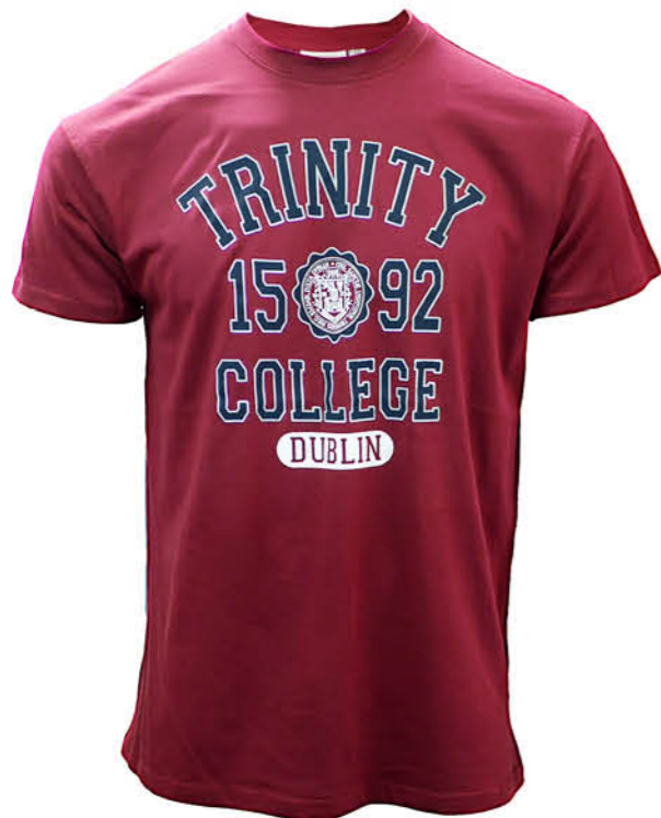
TRIN1023 BURGUNDY TRINITY 1592 T-SHIRT (XS,S,M,L,XL,XXL)