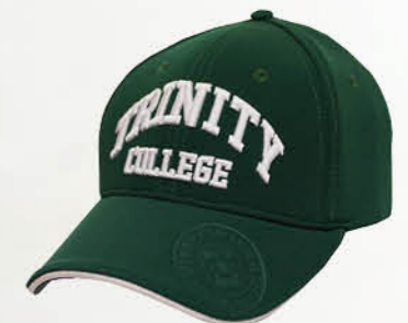
TRIN6009 BOTTLE/WHITE TRINITY PERFORMANCE B/BALL CAP (ONE SIZE)