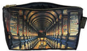
TRIN9010 TRINITY LONG ROOM PHOTO COSMETICS BAG