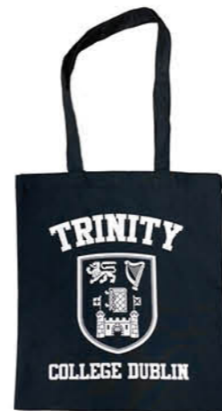
TRIN9039 BLACK/WHITE TRINITY COLLEGE CREST TOTE BAG