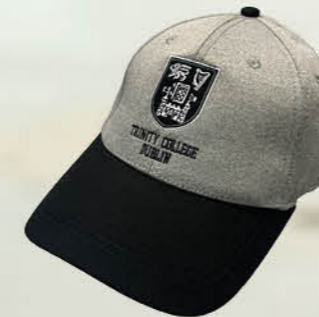
TRIN6019 GREY/BLACK TRINITY CREST B/BALL CAP (ONE SIZE)