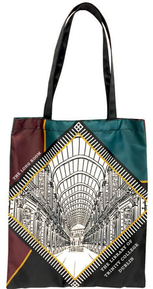
TRIN9014 TRINITY LONG ROOM ARCHITECTURE TOTE BAG