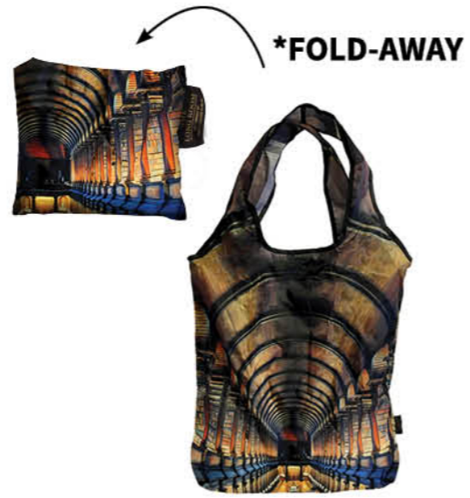
TRIN9012 TRINITY LONG ROOM PHOTO FOLDABLE SHOPPER