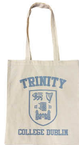
TRIN9038 NATURAL/GREY TRINITY COLLEGE CREST TOTE BAG