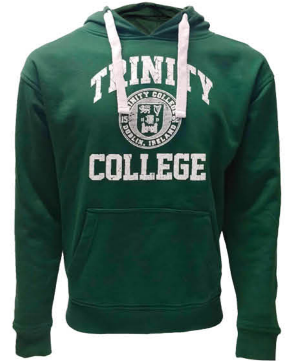
TRIN5016 BOTTLE TRINITY COLLEGE CREST HOODIE (XS,S,M,L,XL,XXL)