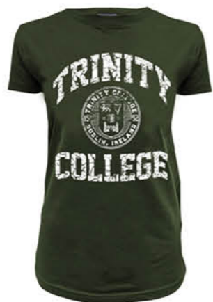
TRIN4013 BOTTLE / WHITE TRINITY COLLEGE CREST LADIES T-SHIRT (XS,S,M,L,XL)