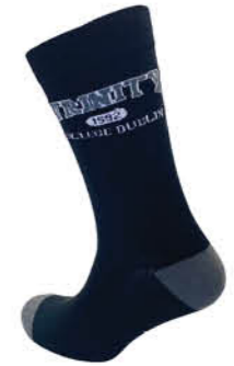
TRIN9032 BLACK/GREY TRINITY COLLEGE 1592 SOCKS (SIZES 6-11)