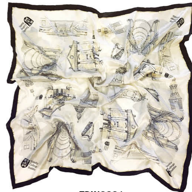
TRIN9001 CREAM/BLACK TRINITY SILK SCARF

This collection has been inspired by the Long Room, the Library of Trinity College Dublin.