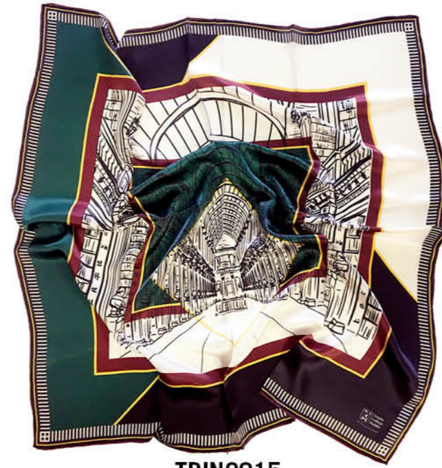
TRIN9015 TRINITY LONG ROOM ARCHITECTURE SILK SCARF