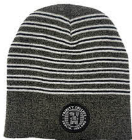
TRIN6023 BLACK/WHITE STRIPE TRINITY CREST KNIT HAT (ONE SIZE)