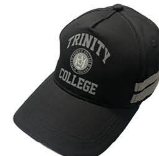
TRIN6018 BLACK/CHARCOAL TRINITY COLLEGE TAPE B/BALL CAP (ONE SIZE)