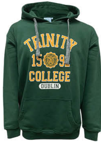
TRIN5065 BOTTLE / MUSTARD TRINITY 1592 HOODIE (XS,S,M,L,XL,XXL)