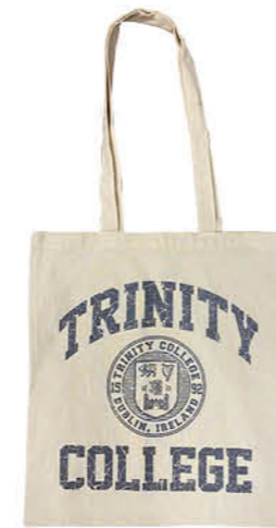
TRIN9036 NATURAL/GREY TRINITY CREST TOTE BAG