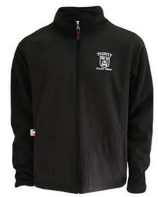
TRIN5013 BLACK TRINITY SPORT FLEECE JACKET (XS,S,M,L,XL,XXL)