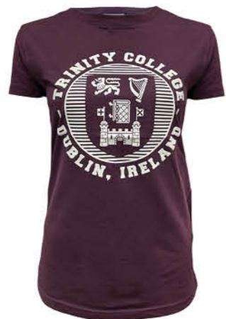
TRIN4012 BERRY / WHITE TRINITY ROUND CREST LADIES T-SHIRT (XS,S,M,L,XL)