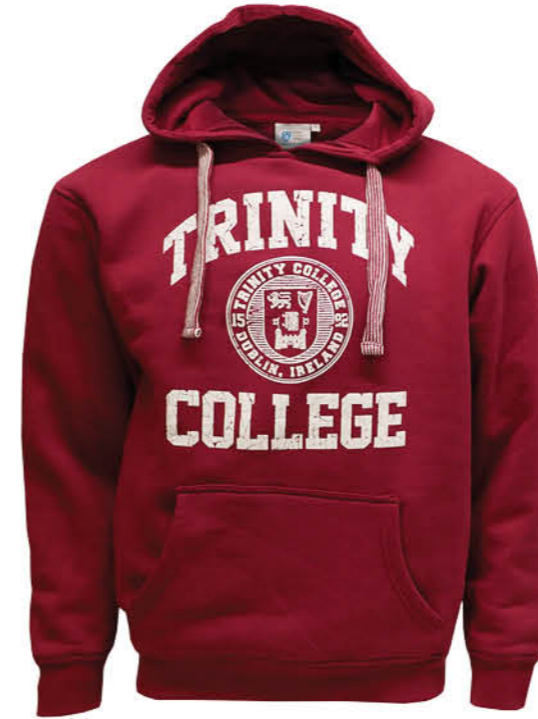
TRIN5000 BURGUNDY / WHITE TRINITY COLLEGE CREST HOODIE (XS,S,M,L,XL,XXL)