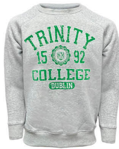
TRIN5068 GREY MARL / GREEN TRINITY 1592 SWEATSHIRT (XS,S,M,L,XL,XXL)