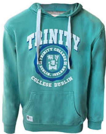
TRIN5098 OCEAN GREEN TRINITY CREST HOODIE (XS,S,M,L,XL,XXL)