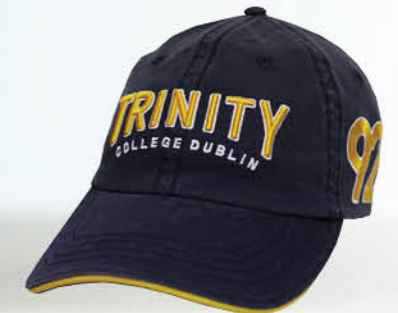
TRIN6005 NAVY/MUSTARD TRINITY COLLEGE WASHED B/BALL CAP (ONE SIZE)