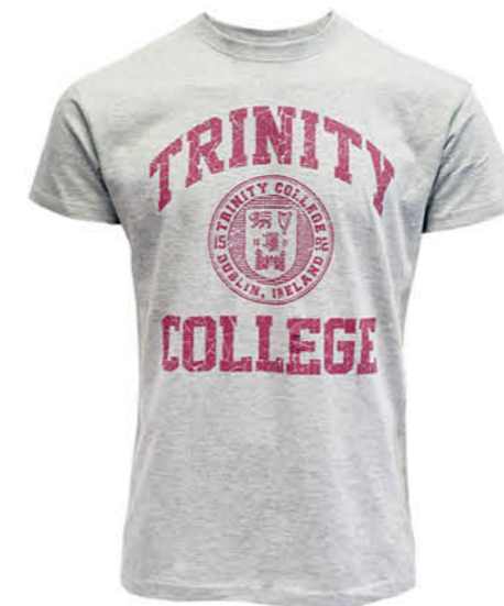
TRIN1004 GREY MARL / BURGUNDY TRINITY COLLEGE CREST T-SHIRT (XS,S,M,L,XL,XXL)