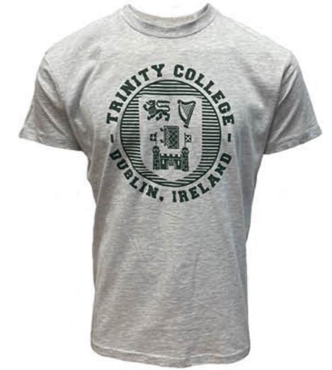
TRIN1037 GREY MARL/BOTTLE TRINITY COLLEGE ROUND CREST T-SHIRT (XS,S,M,L,XL,XXL)