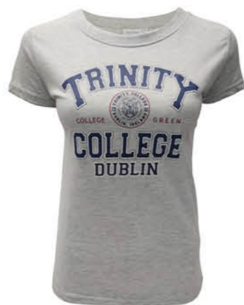
TRIN4010 GREY TRINITY COLLEGE DUBLIN LADIES T-SHIRT (XS,S,M,L,XL)