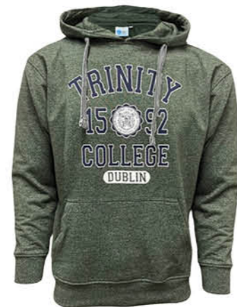
TRIN5064 MOSS GREEN GRINDLE TRINITY COLLEGE 1592 HOODIE (S,M,L,XL,XXL)