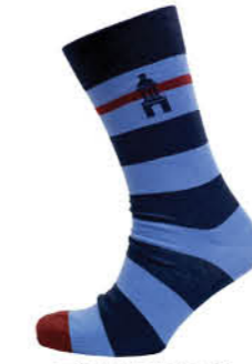
TRIN9004 NAVY/BUE STRIPE CAMPANILE SOCK (SIZE: 6-11)