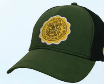
TRIN6008 BOTTLE TRINITY SEAL B/BALL CAP (ONE SIZE)