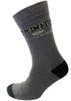
TRIN9034 GREY/BLACK TRINITY COLLEGE 1592 SOCKS (SIZE: 6-11)