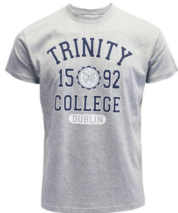
TRIN1001 GREY MARL / NAVY TRINITY 1592 T-SHIRT (XS,S,M,L,XL,XXL)