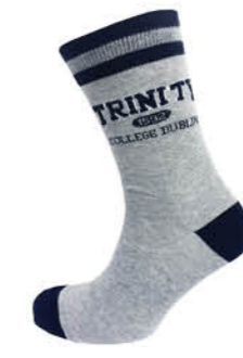
TRIN9006 GREY/NAVY STRIPE TRINITY SOCKS (SIZE: 6-11)