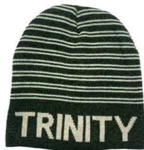
TRIN6022 BOTTLE/CREAM STRIPE TRINITY KNIT HAT (ONE SIZE)