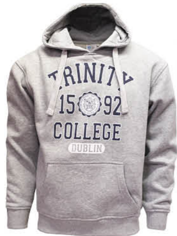
TRIN5002 GREY MARL / NAVY TRINITY 1592 HOODIE (XS,S,M,L,XL,XXL)