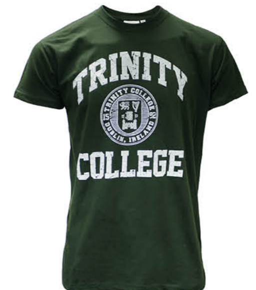
TRIN1019 BOTTLE TRINITY COLLEGE CREST T-SHIRT (XS,S,M,L,XL,XXL)