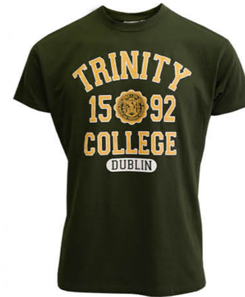
TRIN1000 BOTTLE / MUSTARD TRINITY 1592 T-SHIRT (XS,S,M,L,XL,XXL)