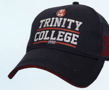
TRIN6001 NAVY TRINITY COLLEGE MESH PRINT B/BALL CAP (ONE SIZE)