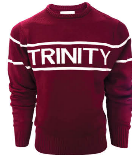
TRIN5087 BURGUNDY/CREAM TRINITY KNIT JUMPER (XS,S,M,L,XL,XXL)