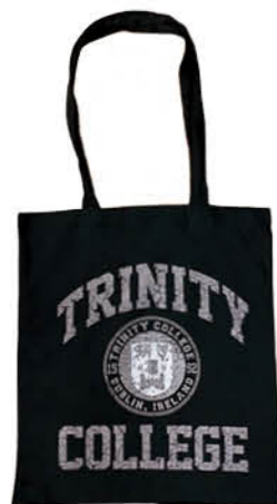
TRIN9037 BLACK/GREY TRINITY CREST TOTE BAG