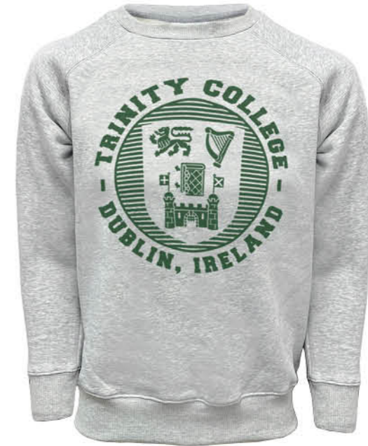
TRIN5067 GREY / BOTTLE TRINITY ROUND CREST SWEATSHIRT (XS,S,M,L,XL,XXL)