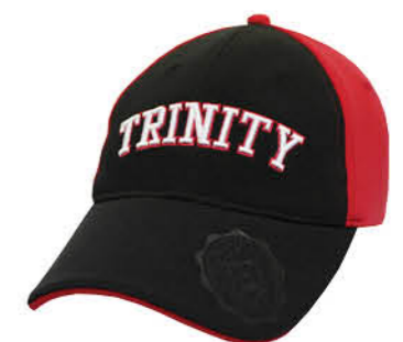
TRIN6010 BLACK / RED TRINITY PERFORMANCE B/BALL CAP (ONE SIZE)