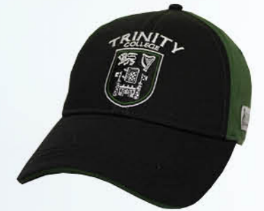
TRIN6002 BLACK/BOTTLE TRINITY CREST B/BALL CAP (ONE SIZE)