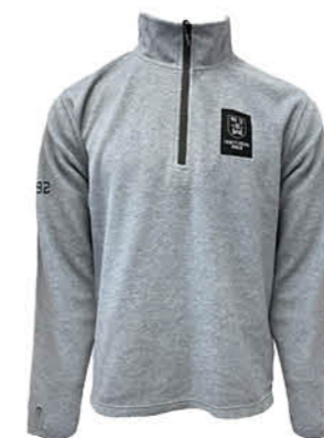
TRIN5083 GREY MARL TRINITY PREMIUM QUARTER ZIP (XS,S,M,L,XL,XXL)