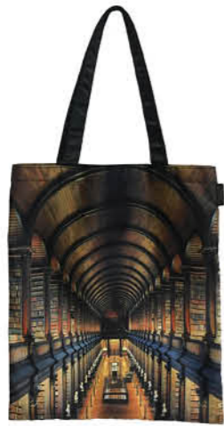
TRIN9011 TRINITY LONG ROOM PHOTO TOTE BAG