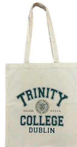
TRIN9028 NATURAL BOTTLE/GOLD TRINITY COLLEGE DUBLIN TOTE BAG