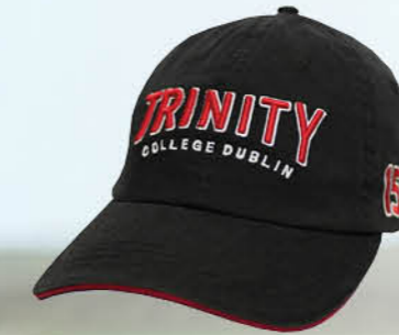
TRIN6004 RED/BLACK TRINITY WASHED B/BALL CAP (ONE SIZE)