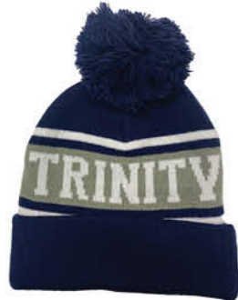
TRIN6021 NAVY TRINITY BOBBLE KNIT HAT (ONE SIZE)