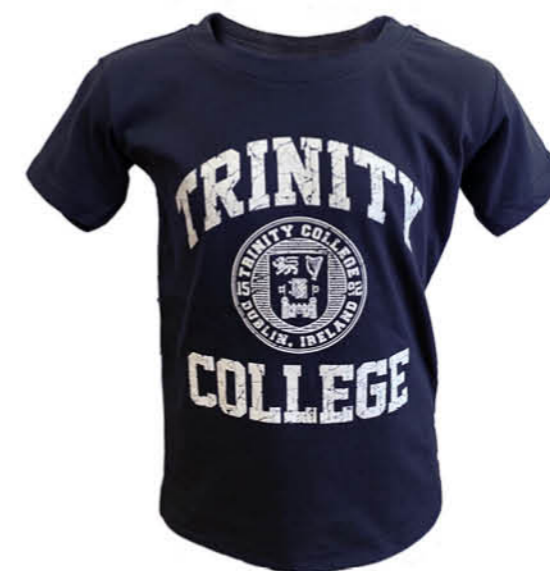
TRIN7012 NAVY/WHITE TRINITY COLLEGE CREST KID'S T-SHIRT (1/2 - 11/12)