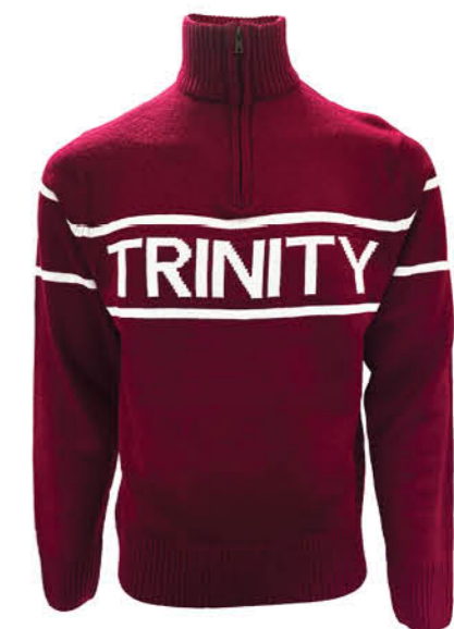
TRIN5088 BURGUNDY/CREAM TRINITY KNIT 1/4 ZIP JUMPER (XS,S,M,L,XL,XXL)