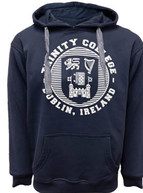
TRIN5050 NAVY / WHITE TRINITY ROUND CREST HOODIE (XS,S,M,L,XL,XXL)