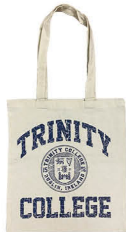
TRIN9025 NAVY/NATURAL TRINITY COLLEGE CREST TOTE BAG