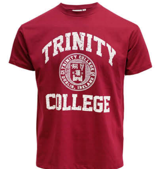
TRIN1005 BURGUNDY / WHITE TRINITY COLLEGE CREST T-SHIRT (XS,S,M,L,XL,XXL)