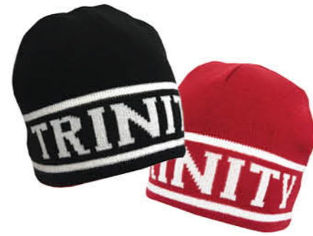
TRIN6012 BLACK/RED TRINITY REVERSIBLE KNIT HAT (ONE SIZE)