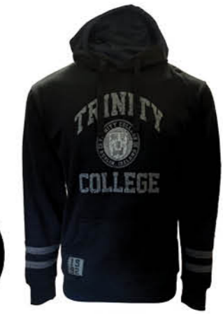
TRIN5081 BLACK/GREY TRINITY BCI PREMIUM HOODY (XS,S,M,L,XL,XXL)