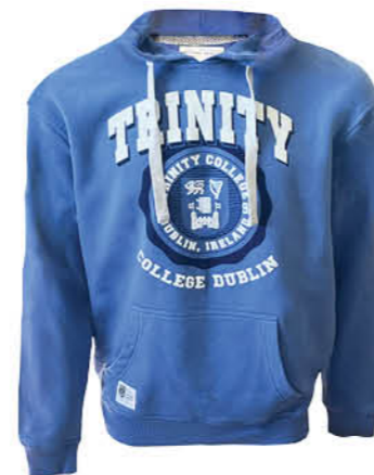
TRIN5099 CORNFLOWER BLUE TRINITY CREST HOODIE (XS,S,M,L,XL,XXL)